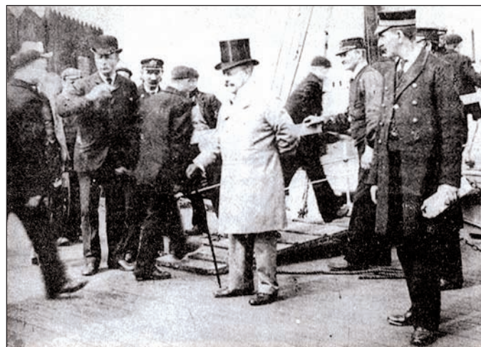
Irish born Thomas Barnardo sees boys off to Canada

According to a 3 August 2010 letter to me from the Secretary to the Minister for Justice, in 1945 the then Minister designated Bethany Home as a place of detention for female Protestant children and young persons. It functioned as a reformatory. I have since enquired where Protestant males were sent. I also asked if the Minister for Education, who controls access to the redress scheme for victims of institutional abuse, from which Bethany residents are excluded, had been informed.