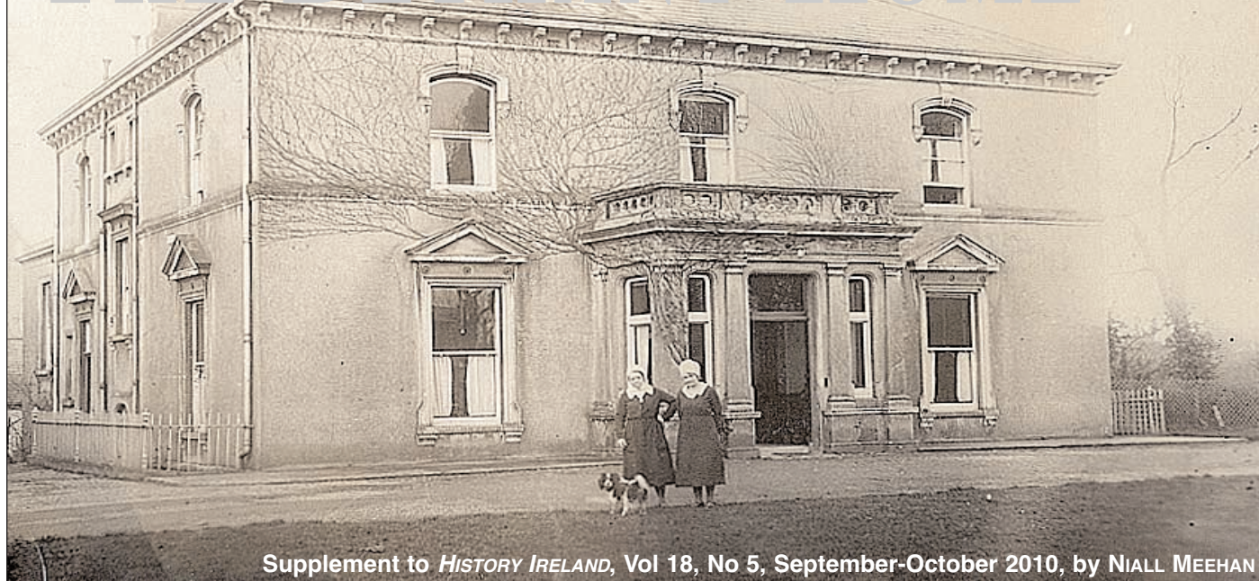
Supplement to HISTORY IRELAND , Vol 18, No 5, September-October 2010, by NIALL MEEHAN