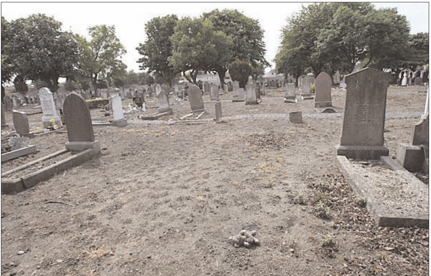
Location of initial Bethany 33 graves discovered in Mount Jerome Cemetery, Dublin - see WWW.BETHANYSURVIVORS.COM